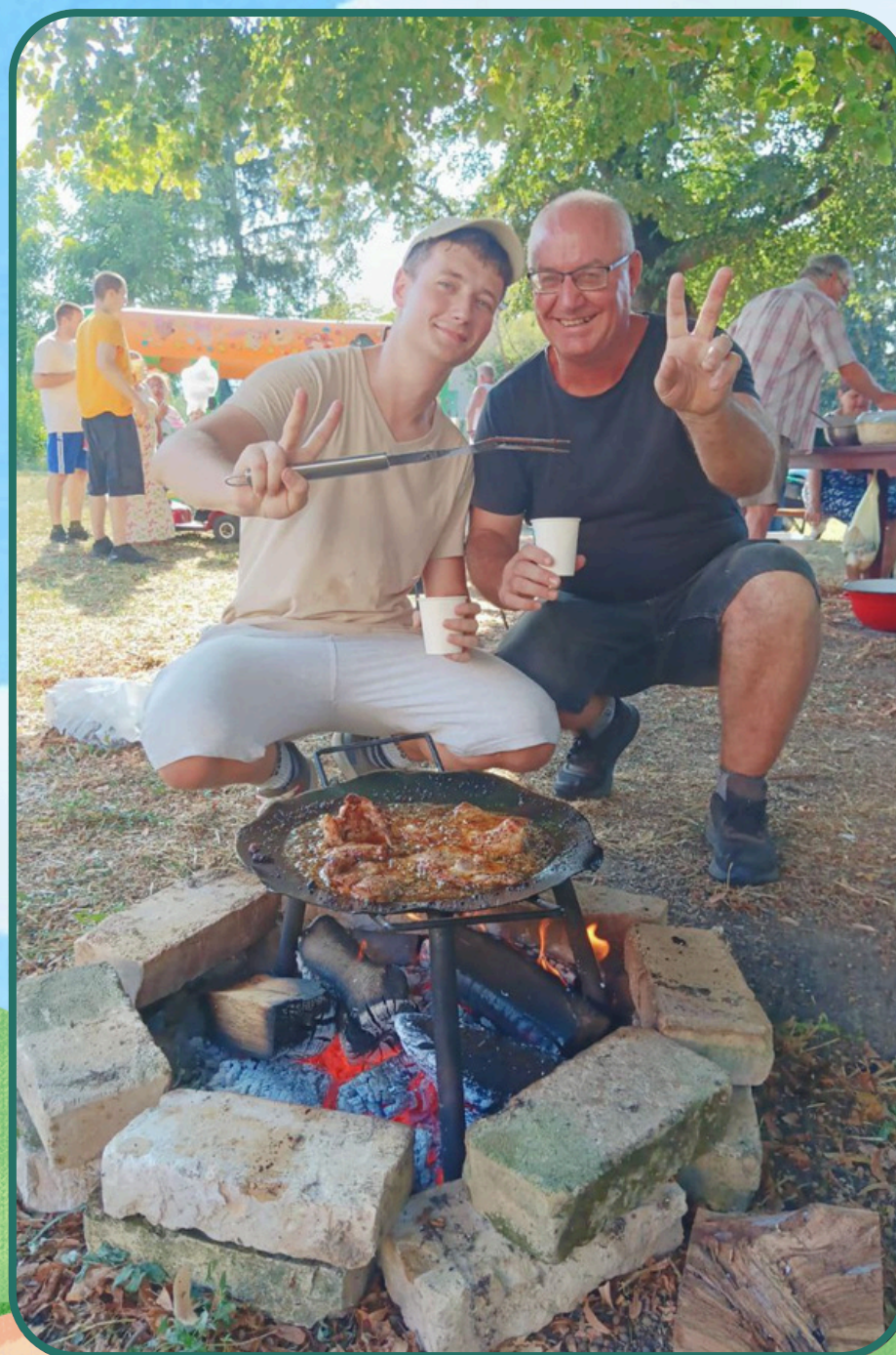
Anything you're passionate about